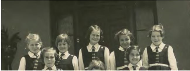
Tiny Tot Boarders, 1951